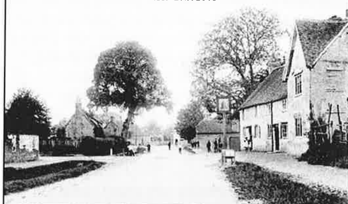
CROWMARSH THROUGH TIME CALENDAR 2018