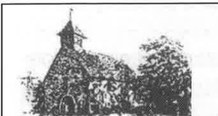
St Mary Magdalene's Church Crowmarsh Gifford

Visit www.bridgewebs.com/wallingford/ to find out more about opportunities to play or to learn Bridge.