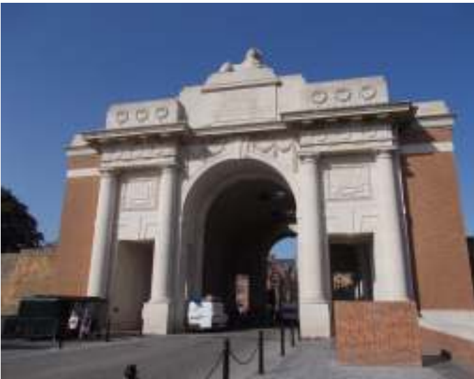
The Menin Gate

In August 1928, the British Legion, as it was formerly known, organised a "Battlefield Pilgrimage" for over 11,000 Veterans and War Widows. They visited battlefields and cemeteries of the Somme and Flanders, before conducting a parade and ceremony at the Menin Gate, in Ypres, to mark the 10th anniversary of the Hundred Days. It was a hundred days from the 8th August, when the offensive started, to the 11th November when the war finished.