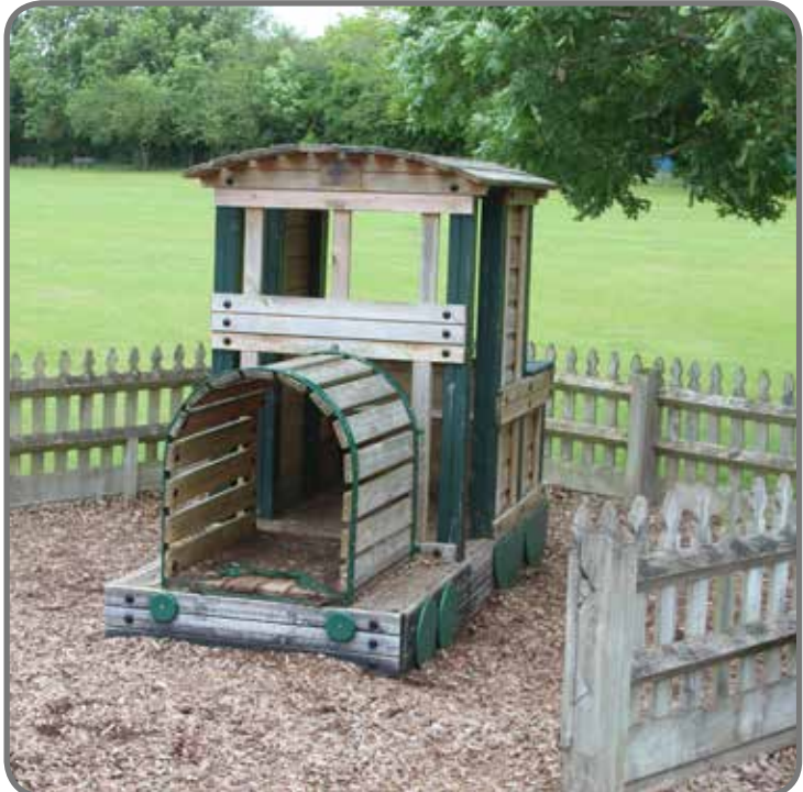
26. Existing train - relocated & refurbished