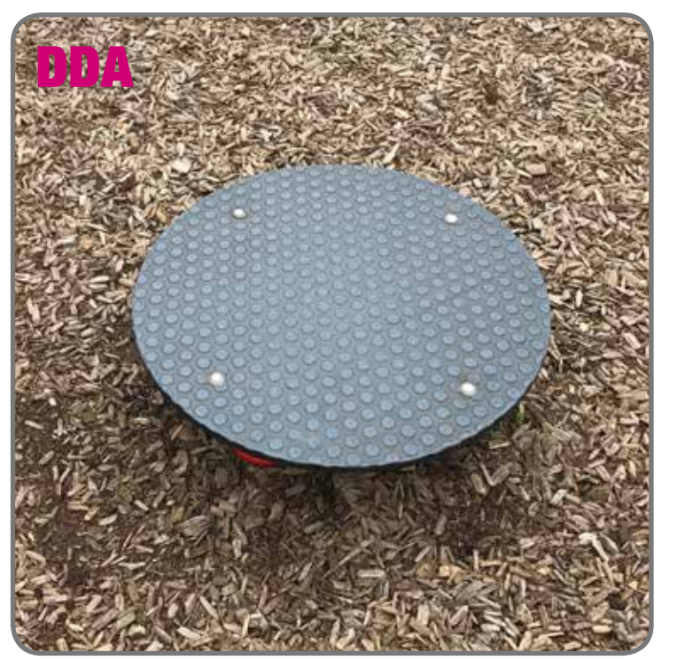
7. 2 x Existing wobble plates - 1 X New