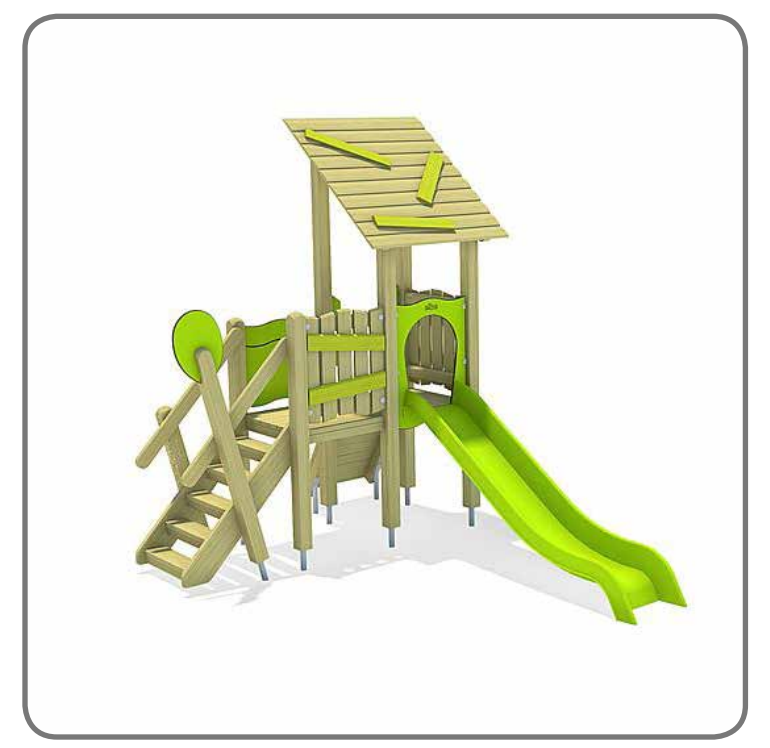
21. Dom play unit 21. Stainless Steel Slide