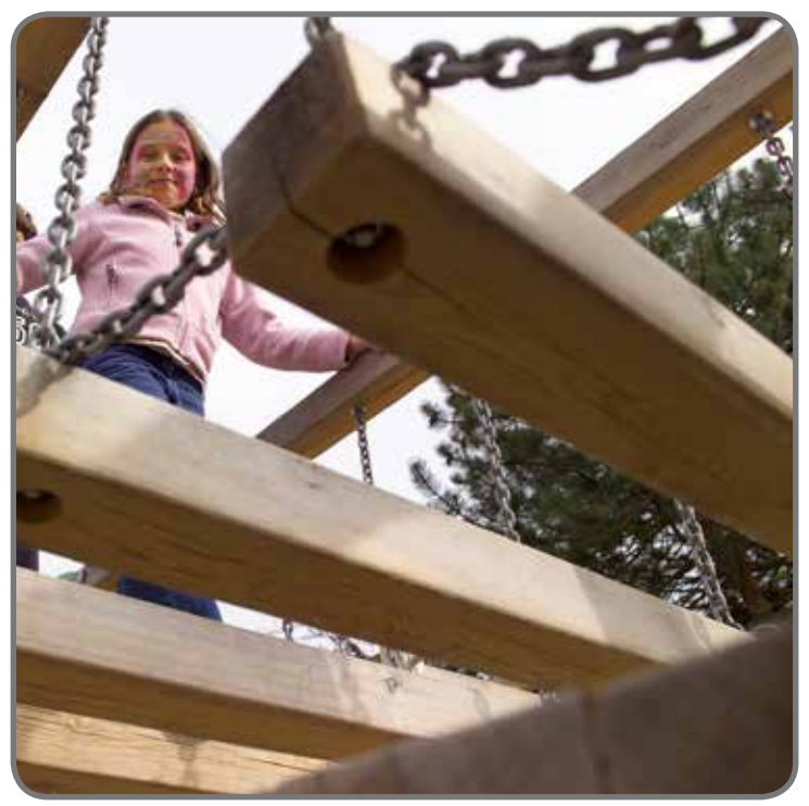
10. 6m Wobbly bridge with 2 x platform