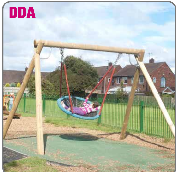
3. Nest swing