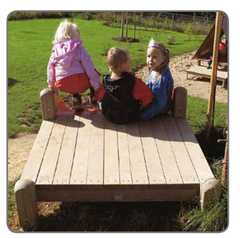
11. 2 x Platform