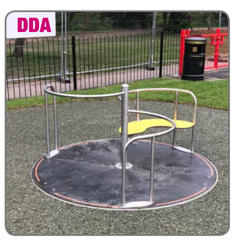
4. Inclusive roundabout