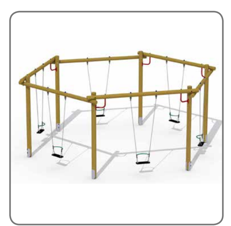
5. 6 bay swing with flat seats and safety bars