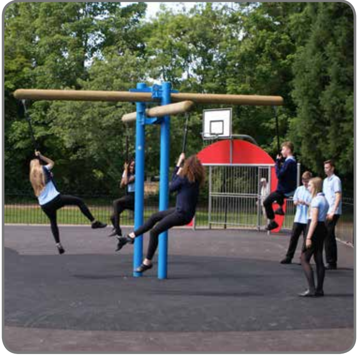
6. High rocker