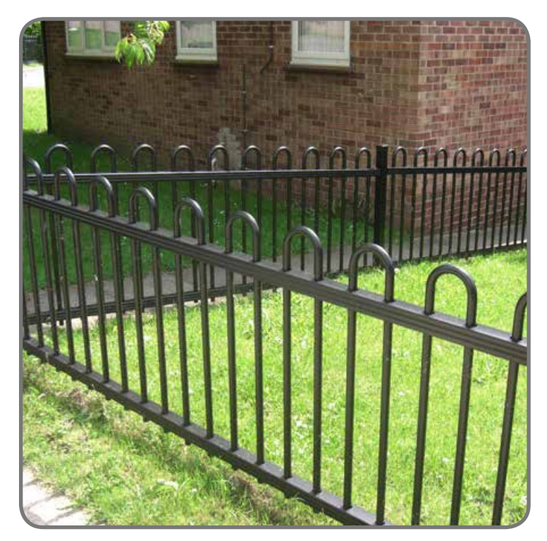
27. Bowtop fence (black)