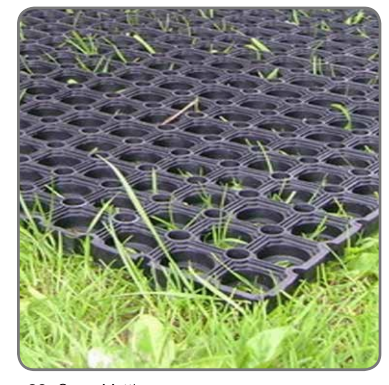
29. Grass Matting