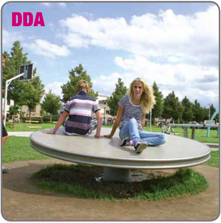
16. Saturn carousel