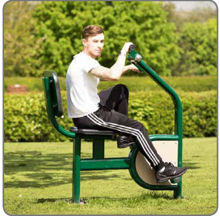
Leg lift Arm & pedal bike