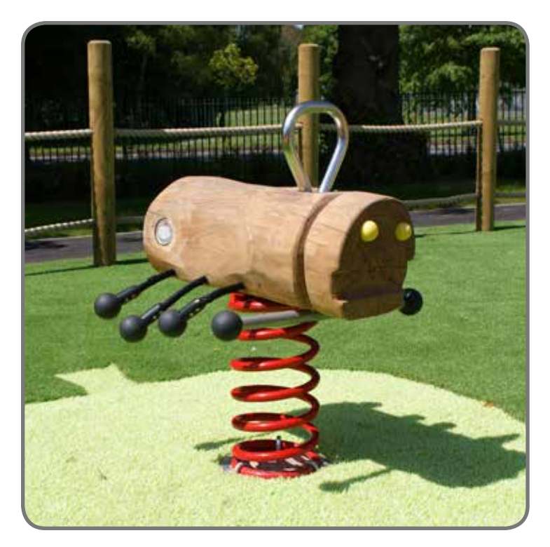
25. 2 x Urgo Spring Rocker