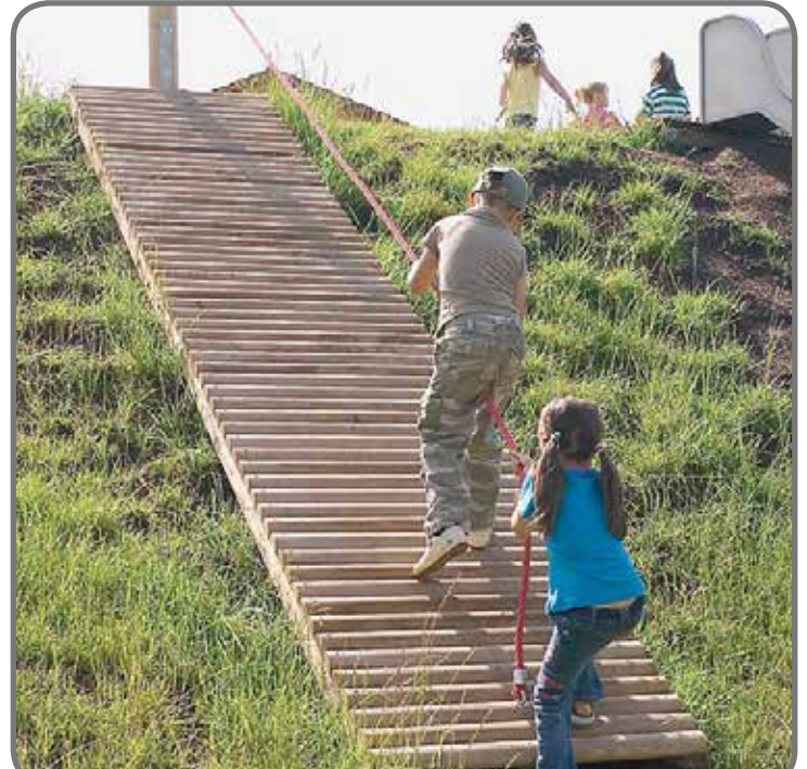
14. Mountaineering ramp