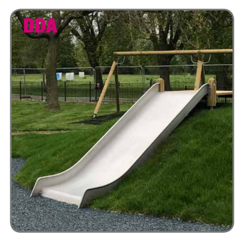
9. Stainless Steel Wide slide