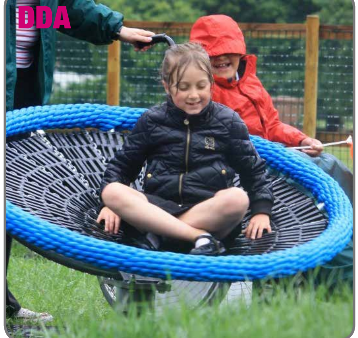
22. Satellite Carousel