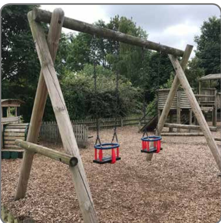
18. Existing toddler Swings