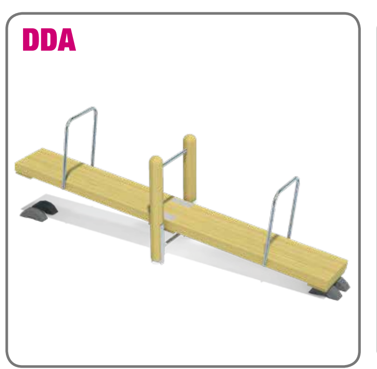
23. Standup Seesaw