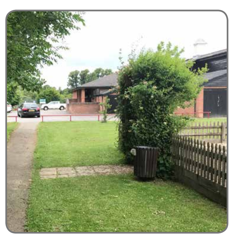
20. Existing archway