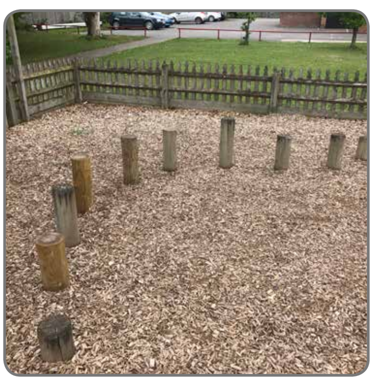
12. Existing timbers