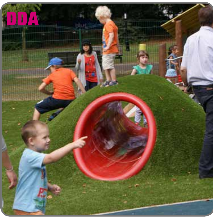
24. Crawling tunnel with artificial grass