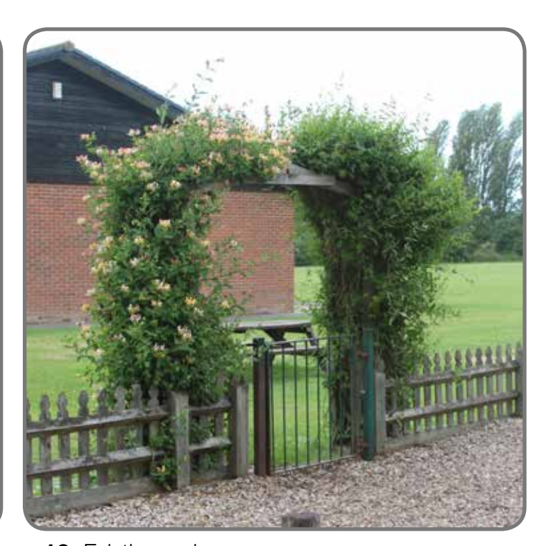
19. Existing archway