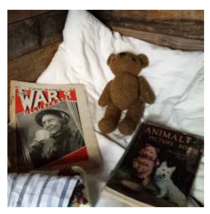
Bed in WW2 air raid shelter

You can find out more about SOFO at www.sofo.org.uk and back the project at: crowdfunder.co.uk/anderson-shelter-project.