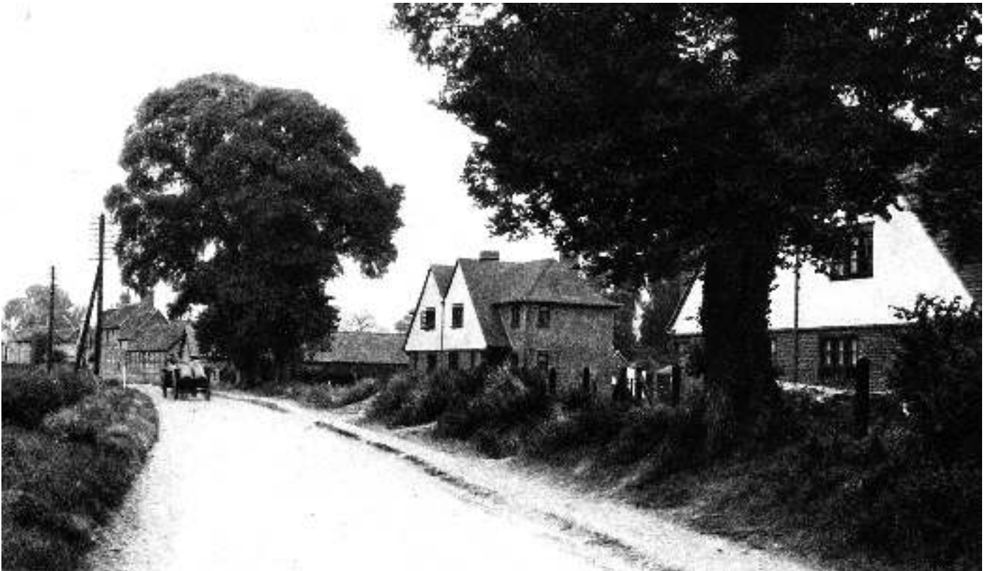
New cottages on Benson Lane, 1924

When Ann and I moved in to 14 Winter's Field we were the youngest family there — now we are the oldest.