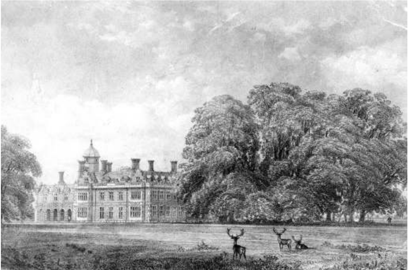
Picture of Howbery Mansion from the 1858 sale catalogue