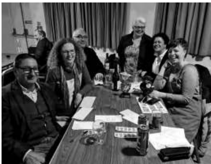
Photo of the winning team