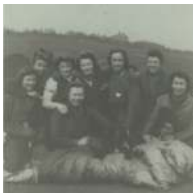
WAAF women with barrage balloon

Women & War will explore the diverse experiences of women who have been involved with all aspects of military life, from the 'fringes' of history to those now taking on front line roles in the armed forces today. Using unique, personal stories, pen portraits of women in historical and modern roles feature throughout.