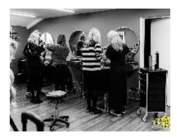
Village salon Warren James Hairdressing Wins Big at the UK Salon Awards!

We are thrilled to share some incredible news with our wonderful community— Warren James Hairdressing has been recognised at the prestigious UK Salon Awards, bringing home THREE awards!