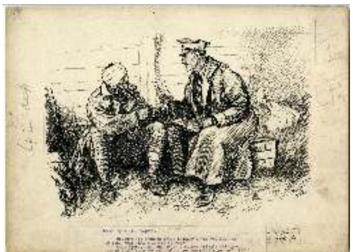
Ref No. ST/6/2 Pen and ink illustration depicting a British officer reading a letter to a soldier with a bandaged head. Published in 'London Opinion and Today' magazine on 22 May 1915.

The museum looks forward to welcoming visitors to the new exhibition from 18th January to 31st August 2025.