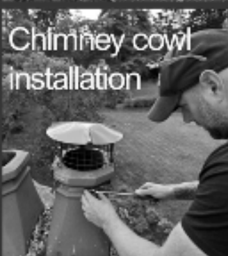
Chimney cowl installation