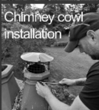
Chimney cowl installation